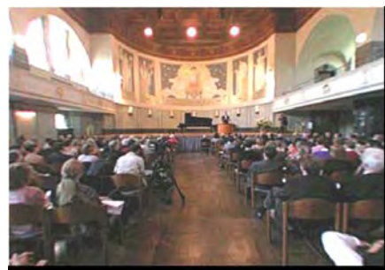
Große Aula, LMU